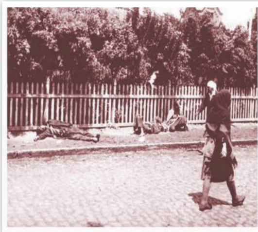
Holodomor victims on a street in Kharkiv, then-capital of Ukraine, 1933.

In 1988, the U.S. Commission on the Ukraine Famine concluded in its findings that "Joseph Stalin and those around him committed genocide against Ukrainians in 1932-1933."