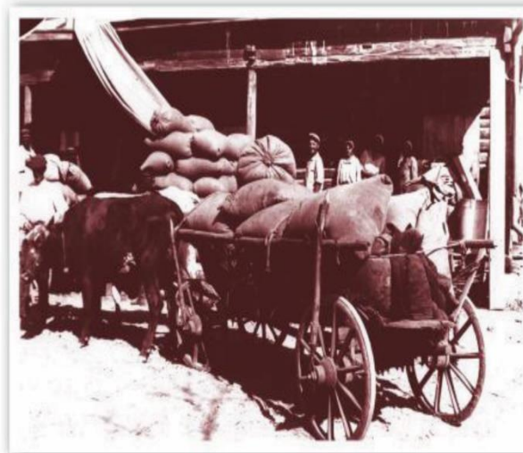
Sacks of grain turned over to authorities in Kaharlyk near Kyiv, 1932.