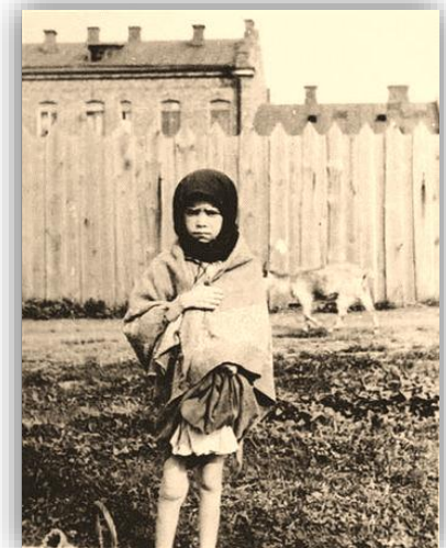
A starving girl in Kharkiv, then-capital of Ukraine, 1933. At least 3 million of the Holodomor victims were children.

At its height in June 1933, the Ukrainian genocide claimed the lives of at least 28,000 people each day.