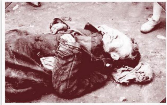
In 1932-33, the Ukrainian countryside became a vast death camp. Entire villages were depopulated, and mass graves covered the landscape. Nearly 25% of Ukraine's population perished during the Holodomor.

*To cover up its attempted extermination of the Ukrainian population, the Soviet regime strictly controlled any travel into the areas hit by starvation. As a result, very few photos were taken, and even fewer have survived to this date.