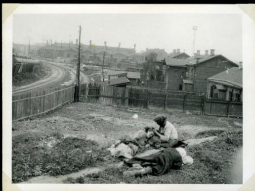
Kharkiv, Ukraine, 1932-33